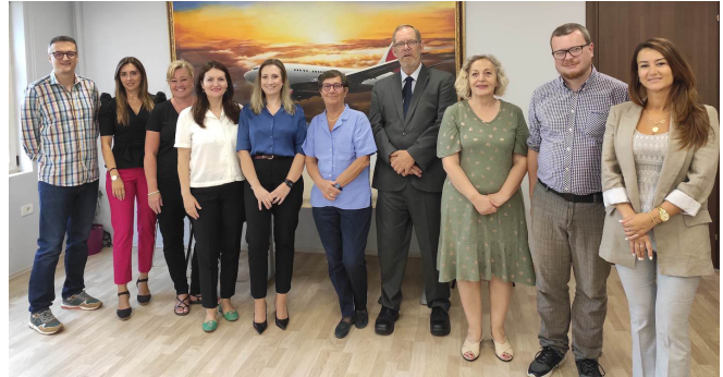
Attendees at the best practices for national auditors training in Tirana, 23-25 August 2022

During the course, particular attention was paid to reviewing best practices for inspecting screening of passenger and cabin baggage, the deployment and use of security equipment, and access control to security restricted areas. ■