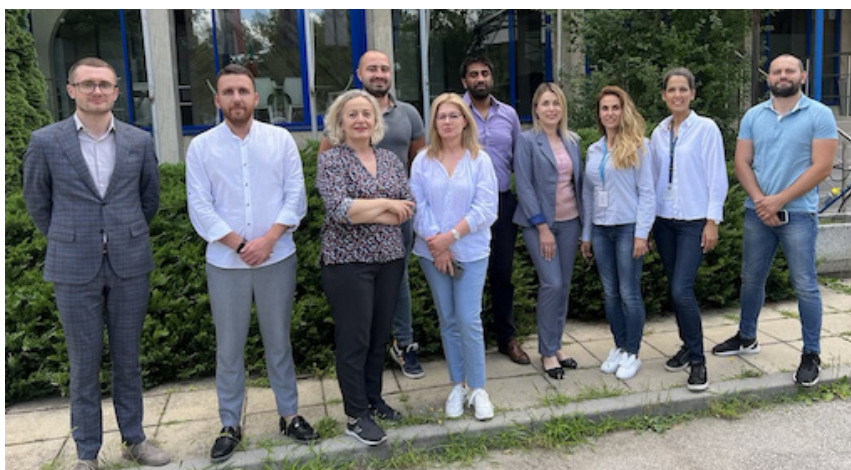
National auditors at the covert testing training course in Sofia, 5-7 July 2022