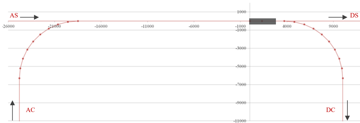
Figure 3-1: Reference case routes

The routes and coordinates are presented in Appendix A, Table A-11 and illustrated in Figure 3-1 below.