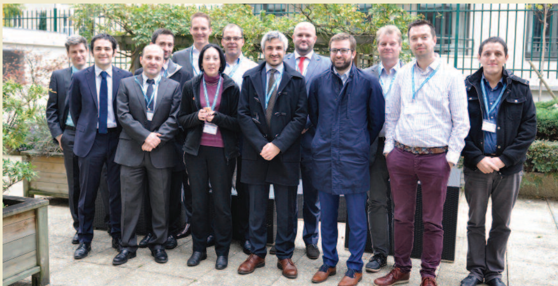
Meeting of the CEP Management Group, November 2017.