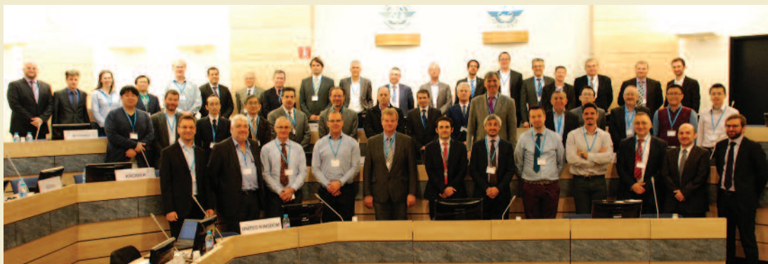
Information session for manufacturers involved in the ECAC CEP, Paris, November 2017.

Through the years, this process has improved a lot and grown to apply to all aviation security equipment, with the exception of those types using x-ray technology, since it has no performance standards as the image is analysed by an x-ray operator.